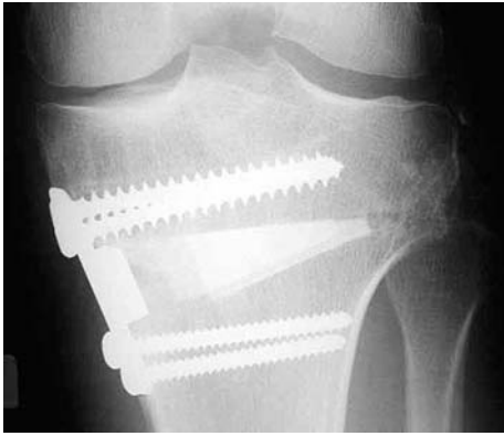
Fig. 1 Postoperative radiograph of an opening wedge high tibial osteotomy in a 42-year-old man. The osteotomy was filled with a tricalcium wedge and fixed with an Arthrex-Puddu plate

study was to report the occurrence of delayed- and non-union following OWHTO for medial compartment arthritis of the knee.